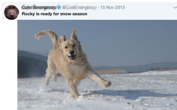
Figure 1: An example of multimodal tweets. In this tweet, “Rocky” is the name of the dog.

Previous methods have studied the NER problem from different aspects. Various supervised methods with manually constructed features have been proposed to perform this task. Zhou and Su (2002) proposed the use of an HMM-based chunk tagger. Chieu et al. (2002) introduced a maximum entropy approach with global information. Support vector machines have also been used on the NER task (Isozaki and Kazawa 2002). Because knowledge plays an important role in the NER task, different kinds of resources have also been taken into consideration (Borthwick